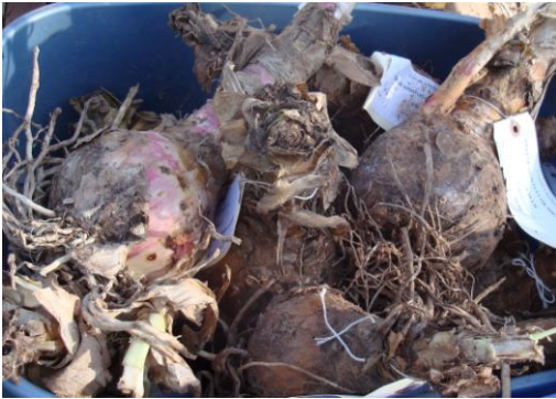
From these humble beginnings crinums will come.

Aside from the love of bulbs and the fun of making desirable bulbs available in a common place for others to snap up, the next best part of the bulb sale is the numbers – How many people did we reach and how much money did we make?