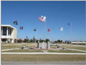
The Veterans Memorial in nearby Chalmette will be the site for one of the LMG09 relandscaping Community Service Projects.

The Master Gardeners of Greater New Orleans (MGGNO) cordially invite our guests attending LMG09 to join us in a special Community Service Project on the last day of the conference, May 24, 2009.