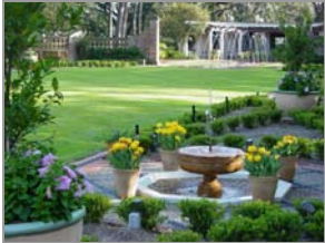
Longue Vue Gardens