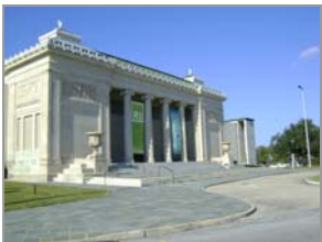
New Orleans Museum of Art

The Master Gardeners of Greater New Orleans are pleased to offer six signature New Orleans tours to our guests attending LMG09. Your registration fee for each tour includes: admission, a box lunch and roundtrip bus transportation. All tours will depart from the Hilton New Orleans Airport Hotel at 12:30 p.m. on Saturday, May 23, 2009, and return to the hotel by 5:30 p.m. Space is limited to bus capacity.