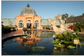
New Orleans Botanical Garden

Two social events will highlight LMG09—The Garden Party on opening night and a Jazz Reception and Silent Auction on Friday evening.