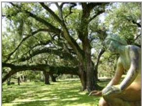
Besthoff Sculpture Garden