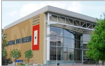
World War II Museum

Memorial Day Salute to WWII Veterans. The National World War II Museum illuminates the American experience during the WWII era with moving personal stories, historic artifacts and powerful interactive displays. From the Normandy invasion to the sands of Pacific Islands and the Home Front, the Museum brings to life the teamwork, optimism, courage and sacrifice of the men and women who won the war and changed the world. Learn why and how World War II continues to influence so many aspects of daily life – civil liberties, global economies and laws, women’s rights, advances in technology and medicine, and most importantly, the values that preserve and protect a free society. After receiving a special orientation to the Museum, participants may choose where to begin this wonderful learning adventure. Tour cost is $27.00.