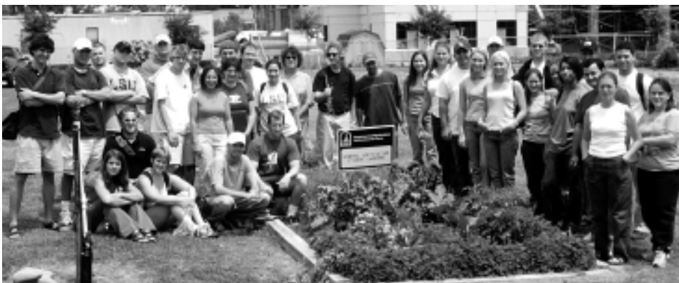
Members of the General Horticulture course gather for a class portrait around their gardens at the Hill Farm during Spring 2001 semester.