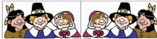
So yummy even the Pilgrims and Native Americans would have loved this drink!

Tip: To make a colorful lava lamps, use cranberry or raspberry-flavored ginger ale, orange soda or apple-flavored sparkling cider. Any carbonated, lightly-colored beverage will work.