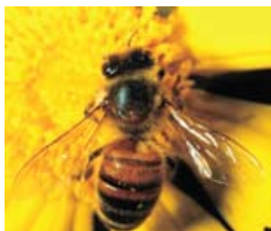
Honey Bee - adult

Honey Bees and Bumble Bees ( Apidae ) - These insects belong to an extremely important family that provides pollination for a number of fields crops and orchards as well as backyard plants. Bumble bees are larger, more robust and are characteristically black and yellow. Honey bees are smaller and are typically golden brown and black.