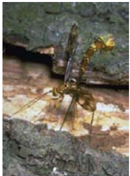
Ichneumonid - adult

( Ichneumonidae ) – These wasps vary in size, coloration, and form but tend to look slender with long, many-segmented antennae and a long ovipositor that can be longer than the insects body. The female wasp uses her long ovipositor to penetrate plants