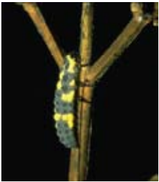
Lady Bug - larvae

bodied insects (whiteflies, thrips, mites, small caterpillars), most notably aphids. The larval stages are 3/8-inch long, slender, moderately flattened and resemble small alligators. The