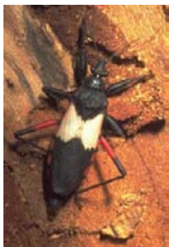
Assasin Bug - adult

Syrphid Flies or Flower Flies ( Syrphidae ) – Many species of syrphids are predacious on other insects (chiefly aphids) during their larval stage. The larvae are long, slender and “maggot-like” in appearance. The adults are important pollinators for a variety of backyard plants.