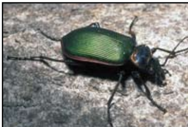
Caterpillar Hunters - Carabids - adult

Ground Beetles ( Carabidae ) – This family encompasses a large number of species (2,200+) that range in size and color and can be found in a multitude of habitats (under stones, logs, leaves, bark). Both larvae and adults are generalist predators and feed on a wide assortment of insects. One of the most common carabids seen is the metallic-colored beetles belonging to the genus Calosma and often called caterpillar hunters.