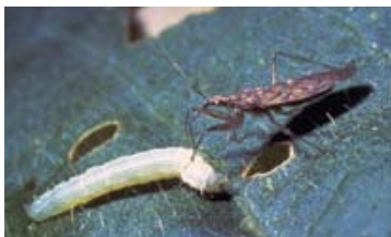
Damsel Bug - adult

Minute Pirate Bugs ( Anthocoridae ) – These are small (2-5 mm) oval bugs with many species sporting black and white markings. These true bugs feed on small insects and insect eggs and are found on flowers and in leaf litter.