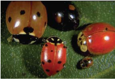
Lady Bug - adult

( Coccinellidae ) – These are small, convex, oval and often brightly colored beetles (many have distinct patterns used for identification). Both the larval and adult stages are predacious on small, soft-