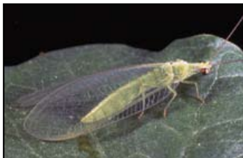
Green Lace Wing - adult