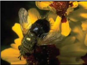
Tachinid - adult

Tachinids ( Tachinidae ) – These insects belong to a diverse family of flies that consists of 1,300+ species. These flies most commonly deposit their eggs directly on the host’s body. The eggs hatch, and the larvae burrow into the host’s body and feeds internally usually resulting in the death of the host.