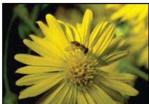
Syrphid - adult