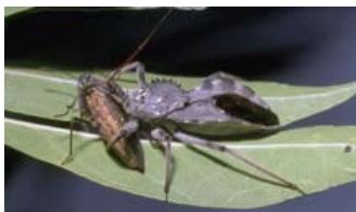
Wheelbug - adult

a painful bite and should not be handled. These insects inhabit a diverse number of habitats in the environment (field crops, leaf litter, orchards, flowers and garden plants).