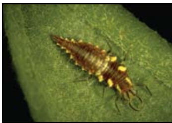
Green Lace Wing - larvae

( Chrysopidae and Hemerobiidae ) – At larval stage this insect is predacious on a number of soft-bodied insects, chiefly on aphids (the larvae are often called aphid lions). The larvae are long, slender insects equipped with large, sickle-shaped mandibles that they use to actively hunt prey. Some adults are predacious but most feed on pollen or honeydew. Some species can be obtained from commercial sources to augment the local populations.