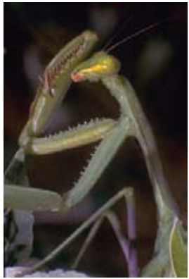
Praying Mantids - adult

( Mantodea ) – These are long slender insects with modified raptorial front legs. These insects feed on a variety of insects including other mantids. They usually lay in wait for their prey with their front legs held in a characteristic upraised position. This behavior has given the rise to their common name “praying mantids.”