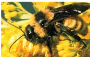
Bumble Bee - adult

Fig Wasps ( Agaonidae ) - The fig wasp's life cycle is closely tied to the fig trees they inhabit with the fig tree relying exclusively of this insect for pollination. The female wasp pollinates the fig tree when laying her eggs usually losing her life in the process.