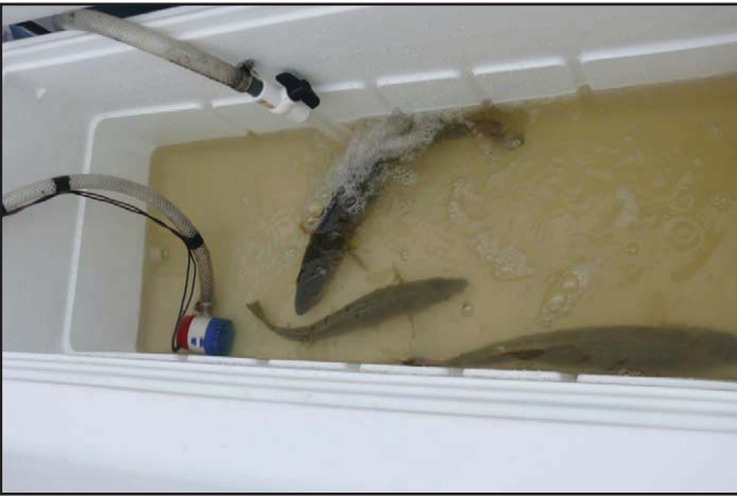
The trout "waiting room."

In early September, Jody Callihan, PhD student at LSU in charge of the project, was confronted with a monumental task. With Hurricane Gustav threatening to destroy the receivers throughout the estuary, he along with LDWF personnel removed and safely stored all receivers, buoys and concrete anchors. With Hurricane Ike coming through the following week, the receivers were not re-deployed until the last week of September. It will be interesting to see what effect Ike's huge storm surge has on these fish.