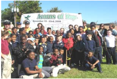
Acorns of Hope