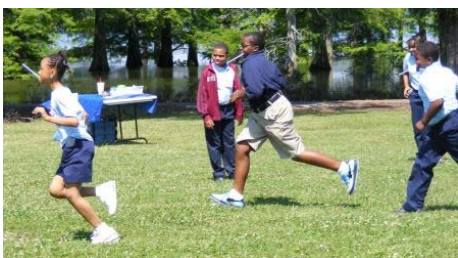
These 4-H’ers are running while breathing through a straw. This demonstrates how hard it is to breath if you smoke.

This year we held a Healthy Lifestyles Field Day/Centennial Celebration in the place of our usual 4-H Achievement Day. 184 4-H members became more knowledgeable of their healthy lifestyle choices by visiting these different exhibits: Height, Weight, & BMI; Grab Healthy Snacks; Healthy Food Choices; Line Dancing; M.O.V.E.; Pyramid Relay; Rethink