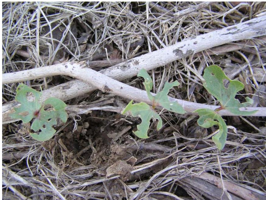
Plate 2. Heavy residue from a previous crop can create a favorable environment for slugs and result in heavy damage to seedlings.