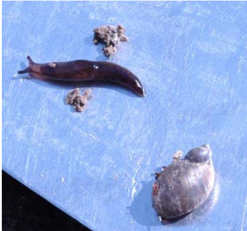
Plate 1. Slug (upper left) vs. snail. Photograph adapted from Catchot et al. 2008, Mississippi Crop Situation No. 7, April 30, 2008.