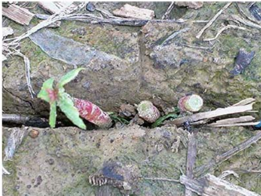
Plate 3. Severe feeding from slugs on seedling leaves and stems can result in plant death.