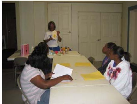
Workshop with youth on life skills and personal hygiene